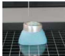
Precision 3D scanning