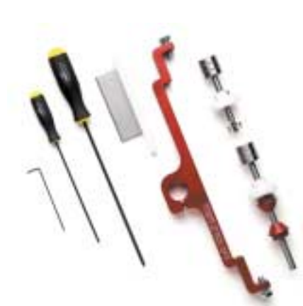
Optional rotary attachment